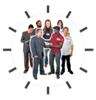
Knows how to get social care when they need it.

They support people who need help to live as independently as possible. This is called Social Care.